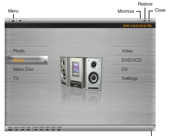
Drag here to resize window

Mobile Theater's simple user interface allows you to control the program with ease. This makes viewing and listening to your media files more relaxing because you do not have to worry about the technical aspects of the program.